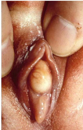
Fig. 5. Gartner's duct cyst.

Imperforate hymen can present with hydrocolpos in newborns due to the maternal estrogen stimulation of the uterus and cervical glands. On examination, a bulging, shiny, white or gray protuberance is noted over the vaginal introitus, but the urethral meatus can be noted anterior to the mass and is uninvolved