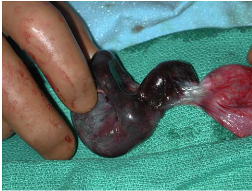
Fig. 2. Intravaginal testicular torsion.

A cremasteric reflex, elicited by gently stroking the ipsilateral inner thigh with subsequent testicular ascent, is classically absent in cases of torsion. Occasionally, one is able to elicit a history consistent with prior similar episodes of pain that resolved spontaneously, consistent with torsion and spontaneous “detorsion.” This condition is commonly referred to as intermittent torsion and is associated with subsequent testicular torsion. With acute torsion, testicular salvage is directly related to duration of symptoms before exploration, with excellent salvage expected with less than 6 hours of symptoms but progressively worse rates thereafter. Beyond 48 hours, the salvage rate is uniformly poor; thus, expedient exploration under optimal anesthetic conditions is usually favored. It is unfortunate that many patients delay presentation and the diagnosis becomes more obscure. In these situations, urinalysis, white blood count, and Doppler ultrasonography or a nuclear testicular blood flow scan may be indicated, if available.