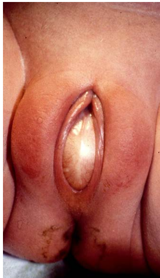
Fig. 6. Bulging imperforate hymen.

Prolapsed ureterocele is usually associated with ureteral duplication anomalies. A ureterocele is a cystic dilation of the distal ureter within the bladder, most often associated with a dilated, poorly functioning upper segment of a completely duplicated renal collecting system. It is usually seen in infancy and is more common in white girls. Early in the course, inspection of the urethral meatus should be possible and confirms that it is intact circumferentially. With prolonged prolapse, however, the mucosa of the ureterocele may progress from a smooth, glistening, pink surface to an engorged, congested, darker appearance, which can limit inspection of the introitus altogether (Fig. 7). Bladder outlet obstruction and significant upper tract abnormalities can coexist, so urgent referral and renal-