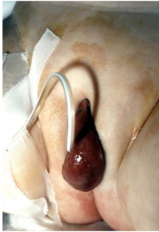
Fig. 7. Prolapsed ureterocele (urethral catheter in place).

bladder ultrasonography are indicated. Ultimately, these patients require a VCUG, nuclear renal scan, and definitive surgical intervention.